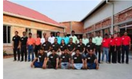
Staff – Testing & Training Centre

Keeping our promise to quality in mind, Al Vakil has also setup Training Centres for our candidates where they are not only trained keeping in mind the requirements of our clients but also the requirements of the country of employment. Our Proficient Trainers harbor years of experience working with the Best of Companies in the Gulf region and thus provide our candidates with adequate practical & theoretical training from their years of professional experience.