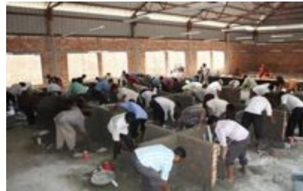
Mason Testing Area